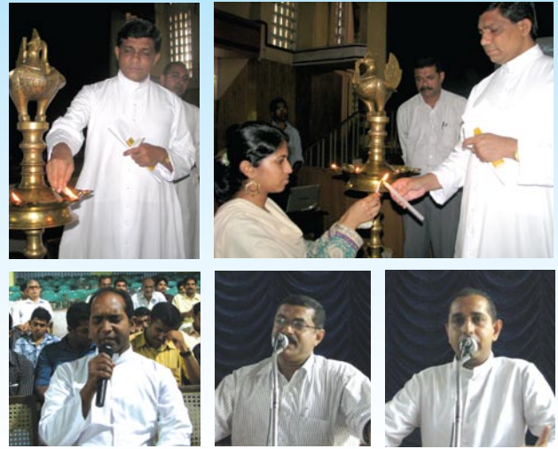
▲ Moments from the induction programme