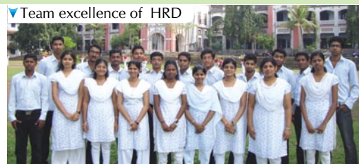
▶ Team excellence of HRD