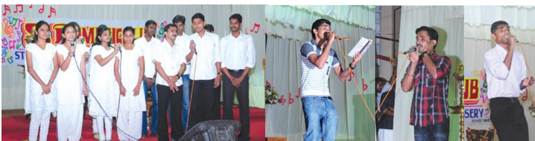
◀ Music club members perform on the stage