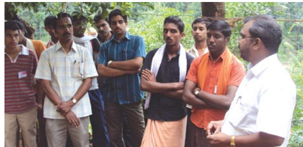
Nss volunteers of seven day camp at Madukka, Koruthodu ▶

The NSS Unit of the College organized Seven Days' Camp in Koruthodu. The inauguration of the camp was held on 20th August 2010.